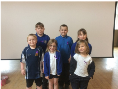
Purple Ribbons awarded weekly.

White ribbons awarded occasionally for something extra special